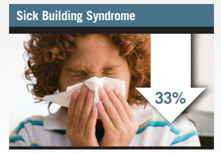
Decrease of 33% in symptom prevalence rates as ventilation rate increases from 17 to 50 cfm per person