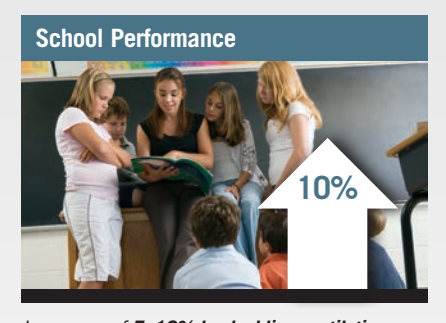
Increases of 5–10% by doubling ventilation