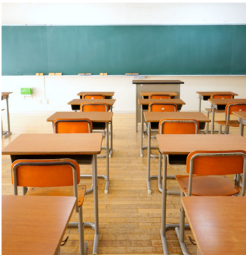
ML14XC1, ML14XP1, ML18XC2